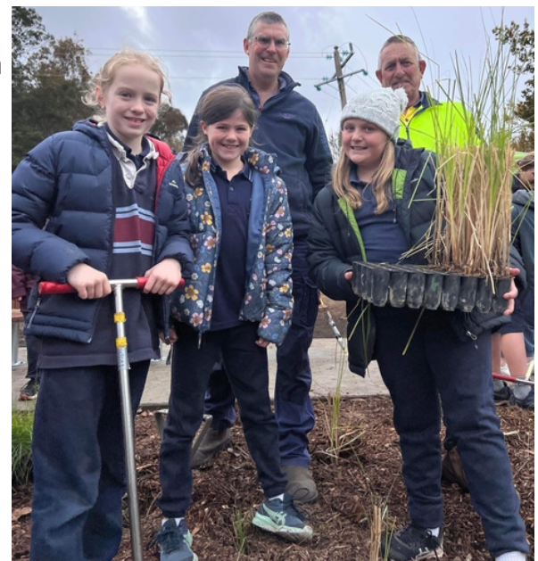
LEFT and RIGHT: Students from Hamilton Gray Street Primary School helped complete the project with planting the last of the native grasses on the banks of the Grange Burn.