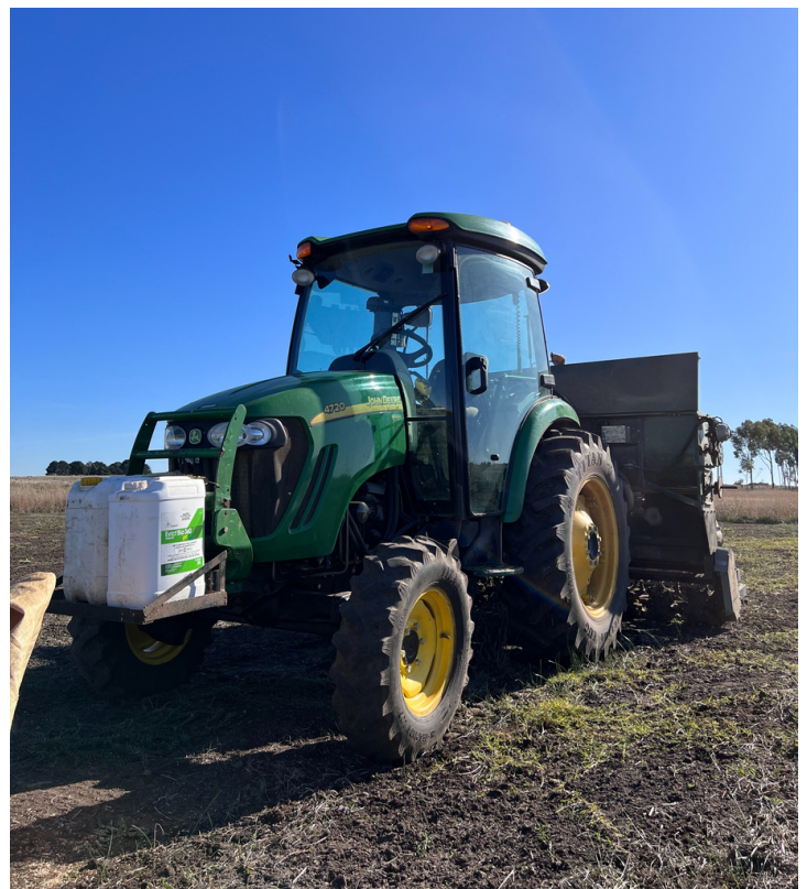
BELOW: The seeding operation underway which included the use of a modified combine specifically for the sowing of native seeds.