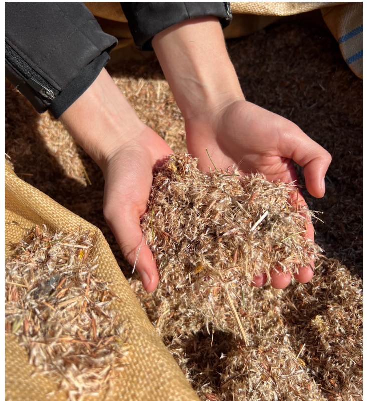
ABOVE: The seed mix sown into the areas of roadside.